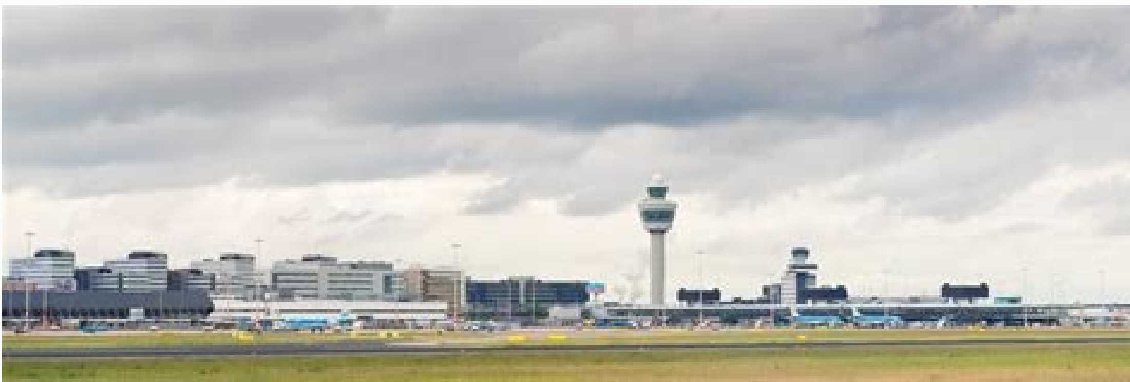
What terminal is departures at dublin airport. Is there a ryanair desk at dublin airport. Dubai airport departure information. Dublin airport passenger information.